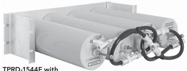
TPRD-1544F with TWX-5 spacers

The Telewave TPRD-1544F allows simultaneous operation of a transmitter and receiver into a common antenna. This pass-reject duplexer utilizes folded four-inch cavities to achieve high "Q" in a compact size.