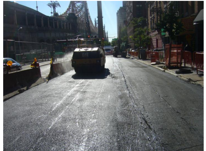
Workers perform paving and final roadway restoration on E. 59 th St. between 1 st Ave. and 2 nd Ave.