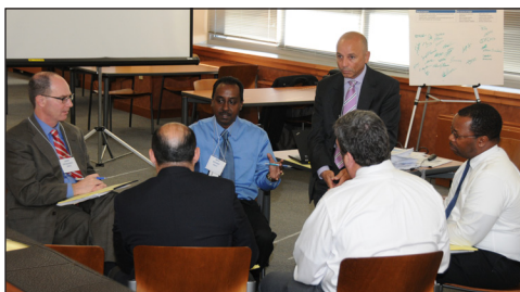
Bureau breakout groups identify key challenges.

Agency personnel—whether at Lefrak City headquarters or in the field—will be a vital component of this program, and will consistently be encouraged to share their ideas and assessments with the OpX team. No one has greater expertise on how best to face the challenges ahead—whether of increased costs, greater demand for services, increasingly strict regulatory environment, or heightened scrutiny of rate increases—than the workers at DEP who serve on