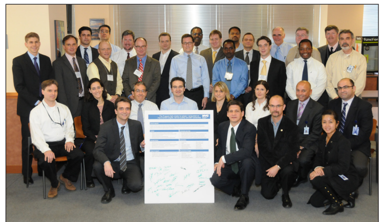
The entire OpX team sign a program charter.

When DEP announced Strategy 2011-2014 earlier this year, the agency knew that its talented staff was up to the challenge. As the first of those four years draws to a close, DEP is embarking upon one of the most essential components of that journey. As OpX teams begin conducting detailed site visits to spur innovative ideas, the plan is evolving from a strategy into a fully realized transformation.