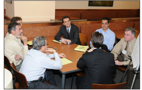
Breakout groups also develop data criteria for success.