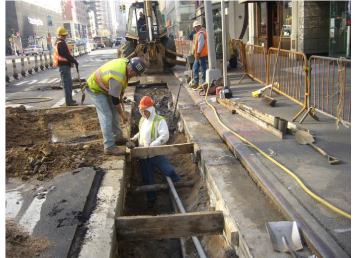
Workers perform excavation and sheeting for a new 20-inch distribution water main replacement on 3rd Ave.

As the project progresses, water service interruptions will be necessary. Water main replacement requires that existing water services be shut off by closing the valves at each end of the section to be worked on. Advance notification will be given for all planned water service interruptions by the afternoon of the day before service interruption. Residents are advised to fill sinks and containers for essential water needs during an interruption in service. Once service is restored, water may be discolored due to mineral sediments that have built up in the older pipes. If this occurs, run only cold water until water appears clear.