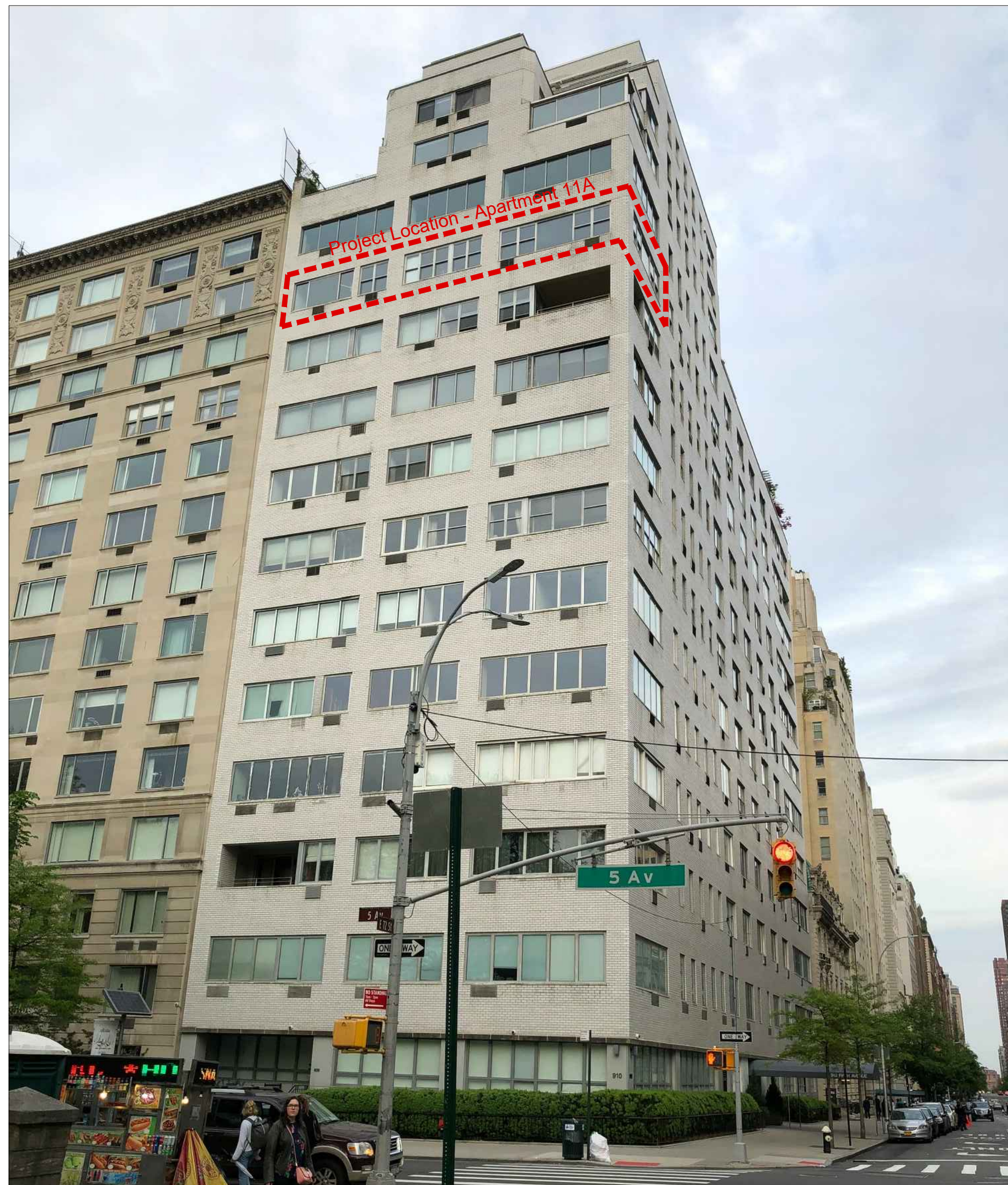
910 Fifth Avenue Building - Existing South / West Facade